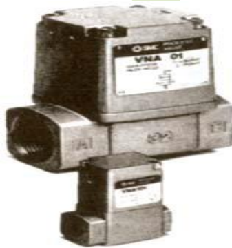
Fig 4. DC Valve

DC Valve is taken to guide the air flow. DC Valves gives direction to compressed air flow in required direction.