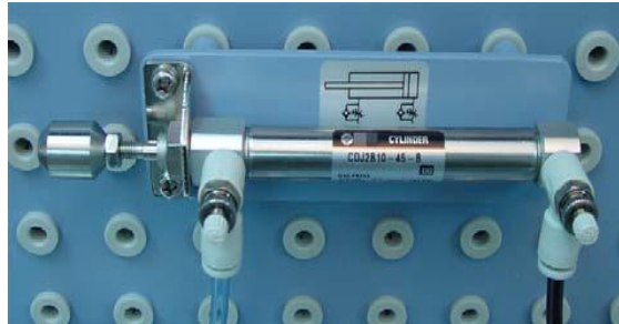
Fig 3. Double Acting Cylinder

We have selected double acting cylinder because we want a motion of piston in two directions i.e. up and down. As knob moved down the piston comes down and when knob moved upwards the piston moves to upward position.