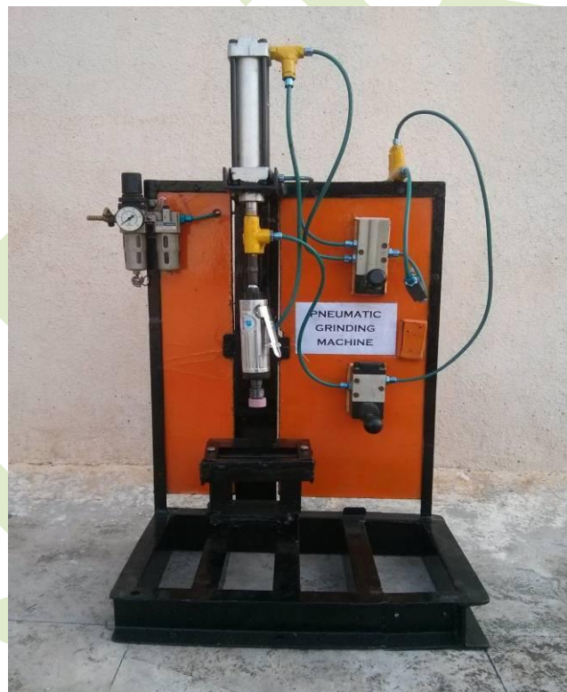
Fig. 6 Pneumatic Grinding Machine

8. A tool bit is attached to connecting rod. We have various types of grinding tools, attaché the required tool to tool bit.