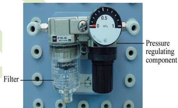
Fig 2. FRL Unit

FRL Unit Consist of Filter, Regulator and Lubricator, Filter is used for removing the impurities from air which is to be compressed, Regulator is used for regulate the air flow and Lubricator is used to lubricate air for smooth operation.