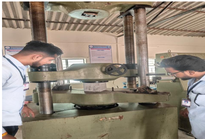
Figure 1. Compression testing

Compressive strength (MPa) = Failure load / cross sectional area.