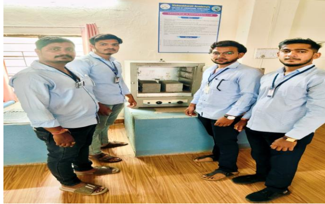
Figure 2. Water absorption test