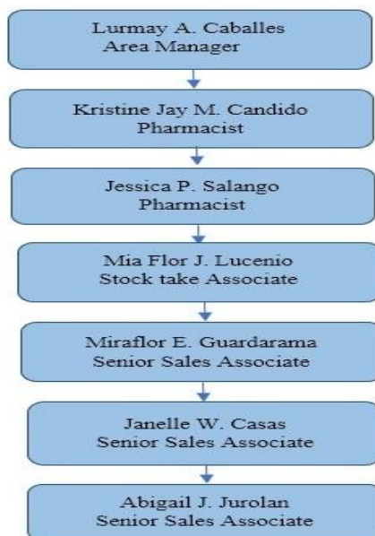
Figure 1: Organizational Structure of Rose Pharmacy Inc. Gaisano Grand Mall