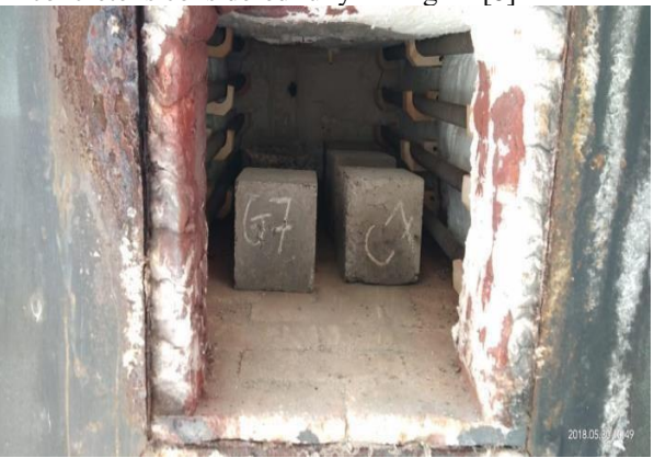
Fig. 2 Concrete Specimens kept in furnace for checking temperature effect

The increase in temperature results in water evaporation, C-S-H gel dehydration, calcium hydroxide and calcium aluminates decomposition, etc. Along with the increase in temperature, changes in the aggregate take place. 'Due to those changes, concrete strength and modulus of elasticity gradually decreases, and when the temperature exceeds ca. 300°C, the decline in strength becomes more rapid. When the 500°C threshold is passed, the compressive strength of concrete usually drops by 50% to 60%, and the concrete is considered fully damaged.'[8]