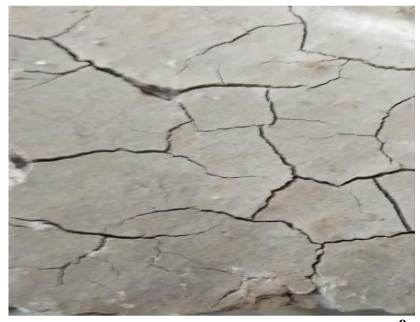
Fig. 3 Concrete surface cracks after exposed to 700<sup>0</sup>C

Proceedings of National Level E-Conference on "Science & Technology" Organized by Shahajirao Patil Vikas Pratishthan's S. B. PATIL College of Engineering Indapur, Maharashtra, India INTERNATIONAL JOURNAL OF INNOVATIONS IN ENGINEERING RESEARCH AND TECHNOLOGY [IJIERT] ISSN No.: 2394-3696, Website: ijiert.org, Held on 15<sup>th</sup> and 16<sup>th</sup> June 2020.