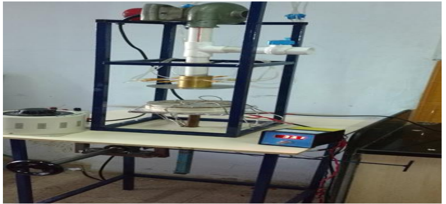
Fig.2a Actual Setup

The experimental set up is shown in Fig. 2a. Air is supplied by an air blower. The flow rate is controlled by valve. Nozzle is made of copper with decreasing cross section to increase Mach number of exiting air. Dimension of nozzle are Length: 8.5cm, Overall Diameter: 6 cm, Inlet diameter: 4cm, Outlet diameter: 1cm. Heater is used to raise the temperature of heat plate more than 200 °C.The heat plate is made up of Aluminum. The heat plate is fixed to the heater by using Screw. Holes are drilled in the slots. The diameter of the heat plate is 175 mm.Mass of the heater plate is 1Kg.The target plate assembly is as shown in Fig. 2b.