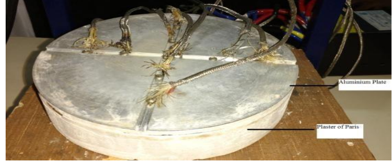
Fig 2b.Target Plate

The experimental set up is shown in Fig. 2a. Air is supplied by an air blower. The flow rate is controlled by valve. Nozzle is made of copper with decreasing cross section to increase Mach number of exiting air. Dimension of nozzle are Length: 8.5cm, Overall Diameter: 6 cm, Inlet diameter: 4cm, Outlet diameter: 1cm. Heater is used to raise the temperature of heat plate more than 200 °C.The heat plate is made up of Aluminum. The heat plate is fixed to the heater by using Screw. Holes are drilled in the slots. The diameter of the heat plate is 175 mm.Mass of the heater plate is 1Kg.The target plate assembly is as shown in Fig. 2b.