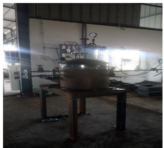
Fig. 4: Experimental Setup

The experimental setup shows that the, how the heat pipes are utilised to develop the heat recovery system.