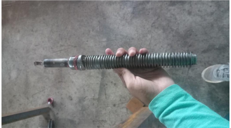
Fig. 2: Heat Pipe

The heat pipe is shown in the figure above, which is useful to carry the heat produced in the machines. Generally the rotating machines produces more heat due to the friction of mechanics parts. The engines working to convert the energy from one form to other are also producing the heat as a waste in energy during the conversion process.