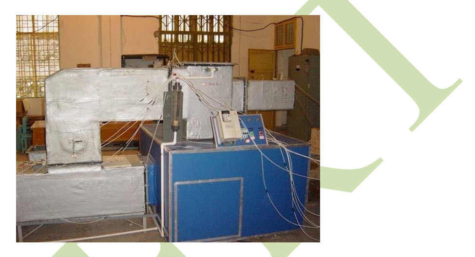
Fig2 view of the REC apparatus

The main measured parameters are the dry-bulb and wet-bulb temperature of air and the air volume in the course of test. The volume of air flow is measured trough the method of speed & area by Pitot tubes. The dry-bulb and wet-bulb temperatures of air flow are measured trough T-type thermocouple. The temperature data are collected and downloaded to a computer by model 2700 data acquisition system.