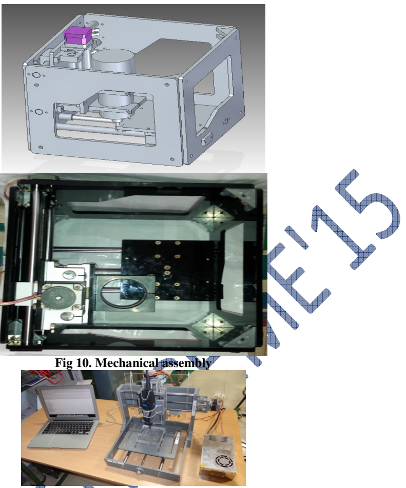
Fig 11. Assembled 3-axis CNC machine

STEPS FOR CNC MILLING PROGRAMMING AND MACHINING The following is the procedure to be followed in CNC programming and machining. The most important is to verify the programme by test run it on the machine before the actual machining in order to ensure that the programme is free of mistakes.