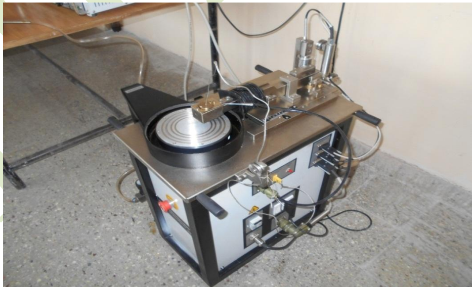
Fig. Wear and friction measuring test rig TR-20

The prepared samples were used for tribological test for room temperature on Wear and friction measuring test rig TR-20. The Wear was performed on a pin-on disc apparatus according to ASTM D2538 and ASTM D2396. The test rig was supplied by DUCOM Instrument Bangalore which is shown fig