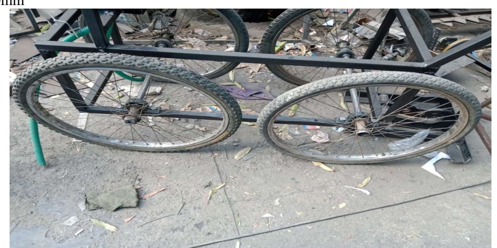
Fig.3: Chassis and wheel assembly

Bars are used to keep constant distance between wheels and foe support also. In this machine we used three bars for support. Length -610mm