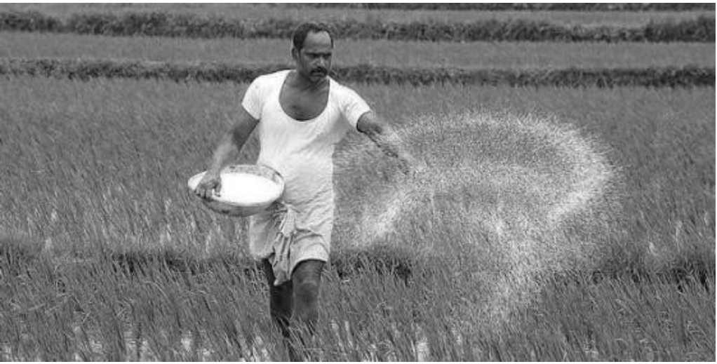
Fig.1: Conventional fertilizer spreading

The traditional machine to spread the fertilizer is needed to be improved. Indian farmers are really in need of the technological solutions at affordable cost. Utilizing the resources at optimum rate is needed. Urea fertilizer dropper machine is designed for efficient and effective fertilization. As total urea required for one acre is 100kg and for each plant is 10gm.So in this machine we required hopper of capacity 24kg because of that maximum area is covered with less passage of machine.