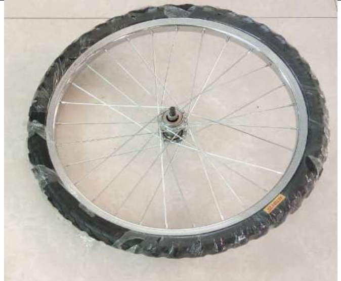
Fig.2: Picture of the Wheel Used