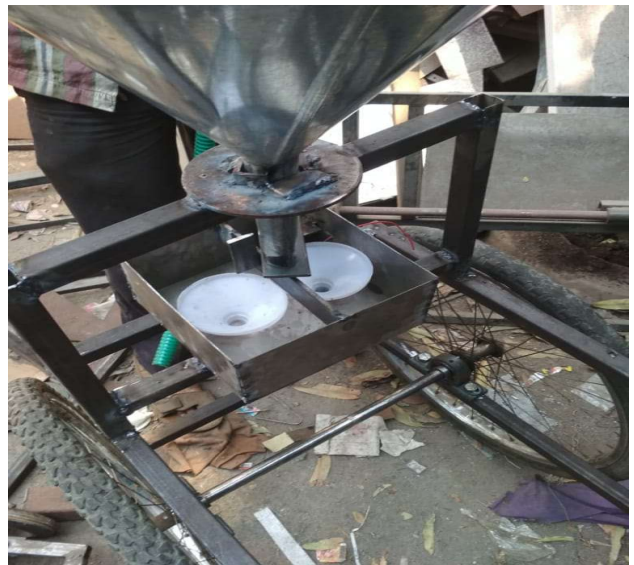
Fig.6: Developed Hardware Prototype of the Machine