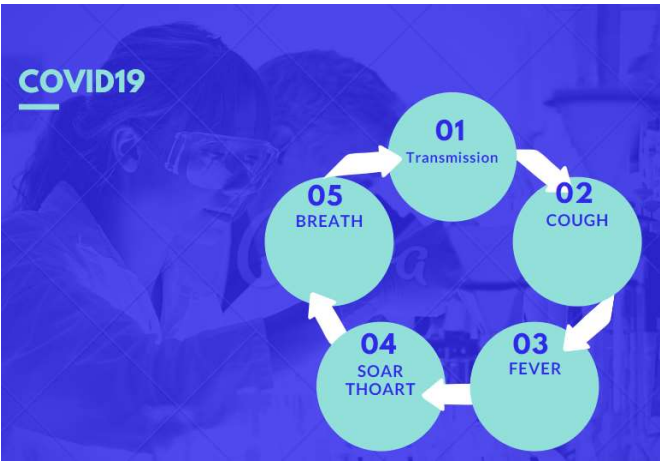
Figure 1; Symptoms chart

Logical relation means Strategy and description. At this stage problem solving is one of the best key for getting rid of this COVID19. We can form it as recall problem. Cause we have seen a bit flax of this kind of problem previous. So, intergration with logical terms and symptoms we can define this virus.