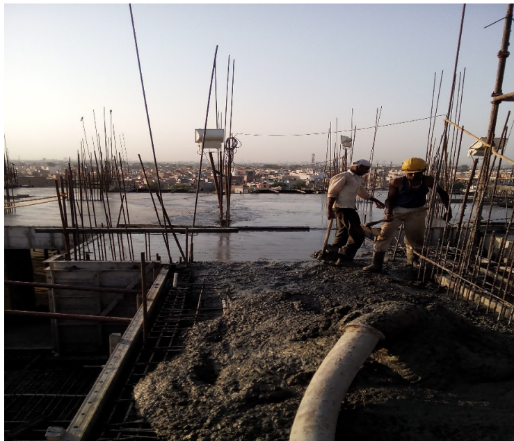
Fig- 4 Showing the concreting work of column, beams and slab.

Step-4:- We can start concreting work after slab shuttering & conduiting work is done.