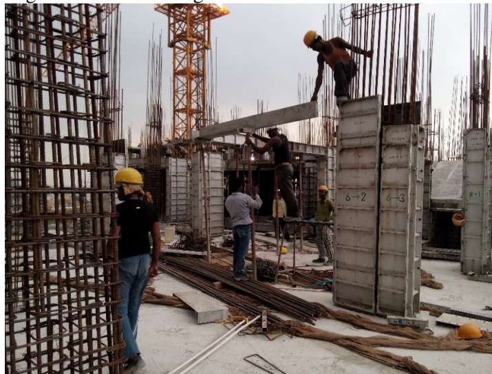
Fig- 2 Showing the fixing of mivan plate on column.

Step-2:- After surveyor provides marking on columns then reinforcement of columns work start after that fixing of mivan shuttering on column is done.