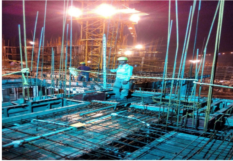
Fig- 3 Showing the complete work of reinforcement of beam, slab, mivan shuttering of slab panels and conduiting works.

Step-4:- We can start concreting work after slab shuttering & conduiting work is done.