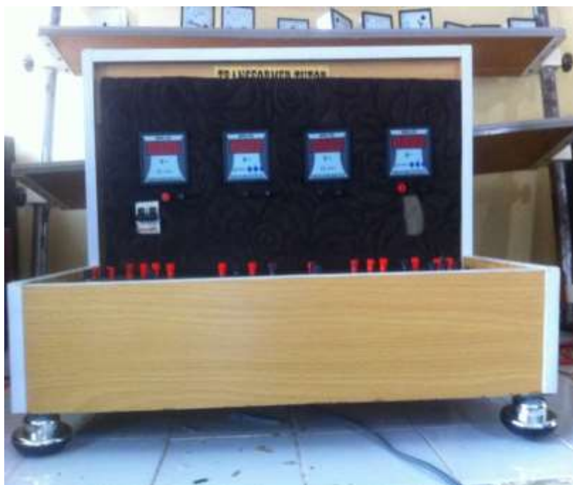
Figure7: Front view of panel meter of the trainer