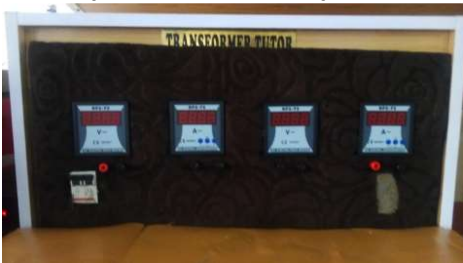
Figure4: Front view of the digital meters