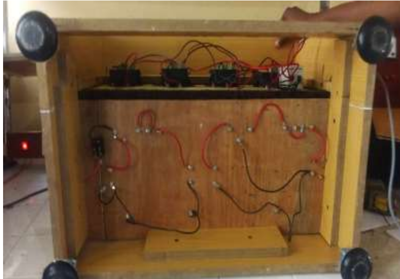
Figure 3: Internal connections of the digital trainer

Figures 3 to 7 shows the picture view of the new digital transformer trainer