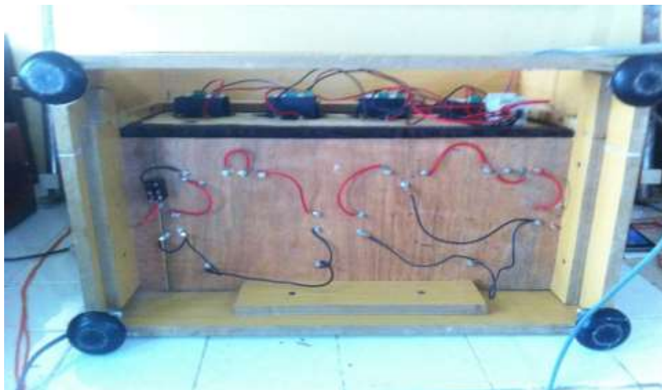
Figure6: Transformer circuit board internal connection