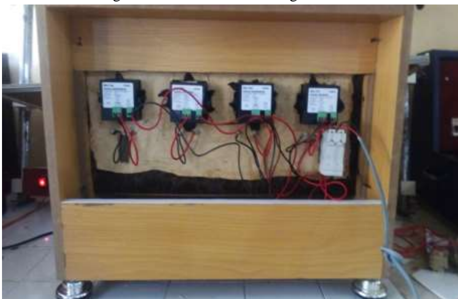
Figure5: Panel meters internal connection