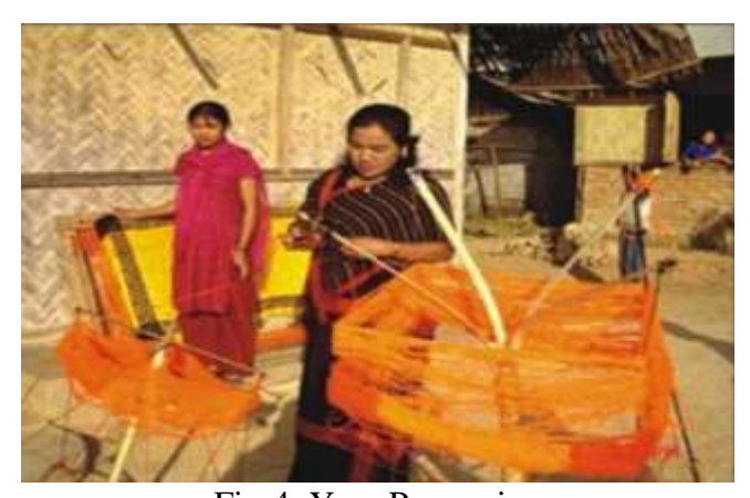
Fig-4: Yarn Processing

Though these days most of the yarn is purchased from the market but those yarns still needs further treatment to prepare for weaving. The skeins are starched and hung out to dry. After the skeins are dry, they are wound round bamboo frames known as natai or nadai and wound into balls known as thum. When industrial yarn is purchased in spools, it is made into skeins with the help of lanya. These skeins are then dyed, starched and made into thum.