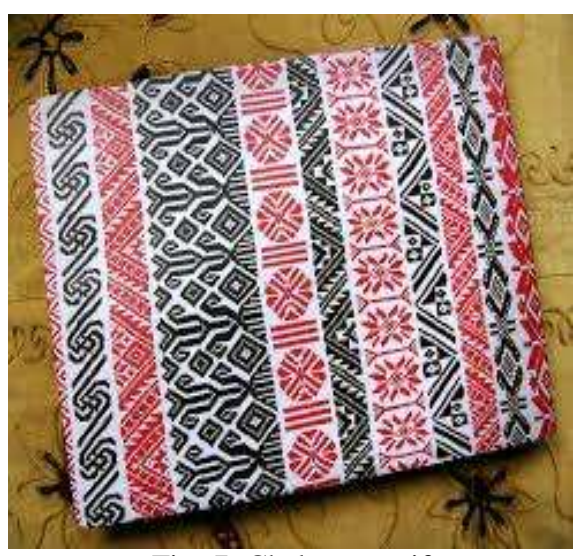
Fig- 7: Chakma motif