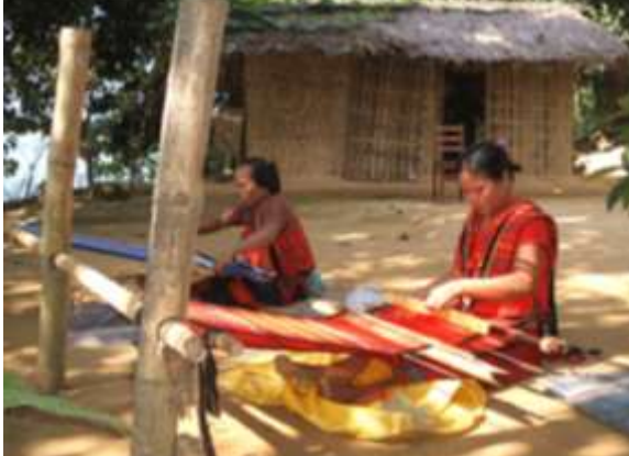
Fig- 6: Weaving