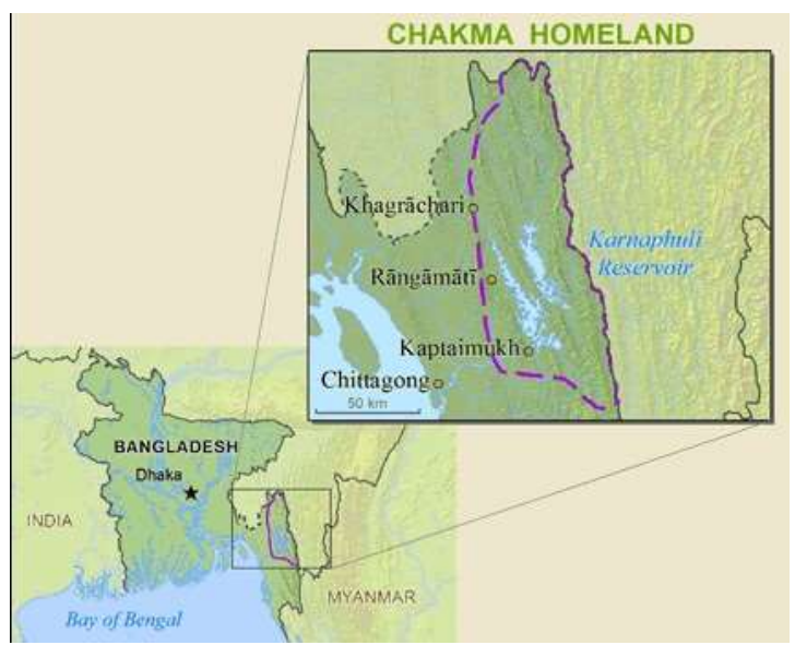
Fig-1: Geographical location of Chakma community

[IJIERT] ISSN: 2394-3696 Website: ijiert.org