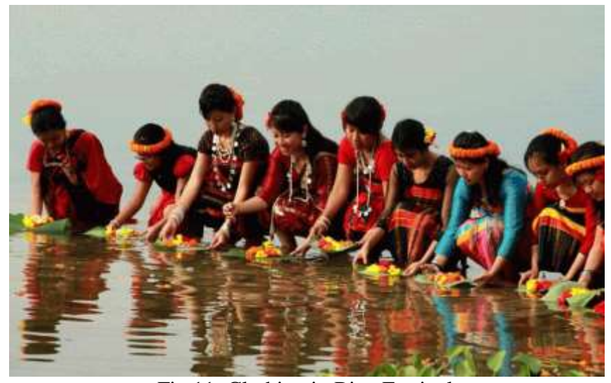
Fig 11: Clothing in Bizu Festival

Kothin Chibor dan is another main religious festival of Chakma community. On that festival day people respect Buddhist monk through offering chibor (means cloth) gift. Women make that chibor on a very traditional way. They collect gin jum cotton, spin the cotton into yarn, collect natural dye, dye yarn, dry the yarn, weave into cloth and sew the cloth into ceremonial dress and present that chibor (ceremonial cloth) to monk. After receiving that robe (chibor) monks left their old robe and wear new robe.