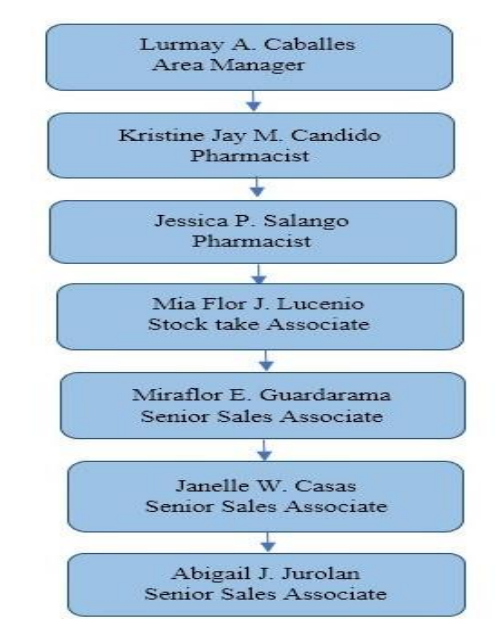
Figure 1: Organizational Structure of Rose Pharmacy Inc. Gaisano Grand Mall