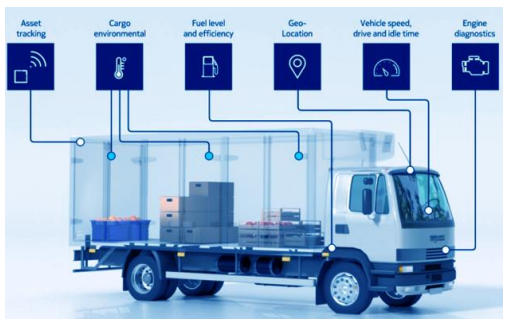
Fig.4 Innovative Packaging

Smart monitoring systems have made it possible for manufacturers to track product losses. During the transit process, the weather, roads and other environmental variables are scrutinised. A pattern can be created by this monitoring via IoT mechanisms. After analysing the trends, companies can quickly determine the best ways to manage the commodity. You will be able to customise your packaging accordingly by using IoT creation services for this reason.[4]