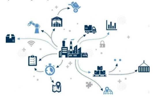
Fig.3 Smart Logistic

Transport drones significantly assist in logistics management. Even though you would think the investments are enormous. Yes, but they are still in the initial stages. It would turn out to be much less than investing in traditional approaches. The needs of components can also be tracked with IoT devices in addition to these. This is used mainly in the airline business. Without human involvement, inventory control can be efficiently managed by IoT devices. [4]