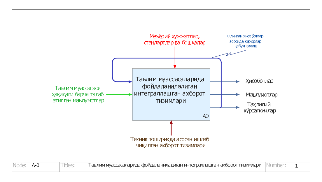
2 -picture. A0 diagram of IDEF1 model

It is based on the developed model IDEF0 we can build a general model of processes in a single integrated information system based on the methodology IDEF1 (2-picture).