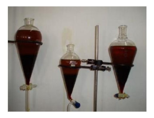
Fig. 4 Separation of HOME and Glycerine.

The methyl ester of vegetable oils leads to improved heat release rates. Power output was found to be superior to pure vegetable oils. However, the transesterification process requires approximately three hours for making the ester and a further 12 hours for separation. It also results in by products such as fatty acids and glycerol. These cannot be used as fuels in engines though they have other uses. This process is one of the reversible reactions and proceeds essentially by mixing the reactants. However, the presence of the catalyst accelerates the conversion.