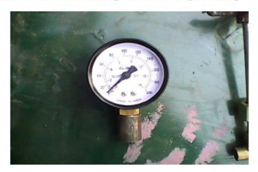
Fig.7 Pressure gauge