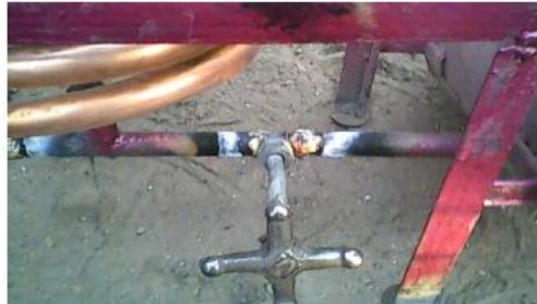
Fig.8 After brazing process