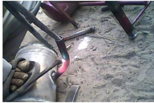
Fig.9 During bending process