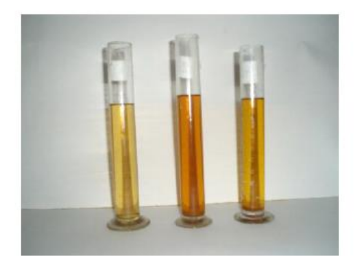
Fig.5 A view showing Bio-Diesel oil and HOME.