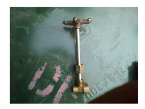
Fig.6 Flow control valve