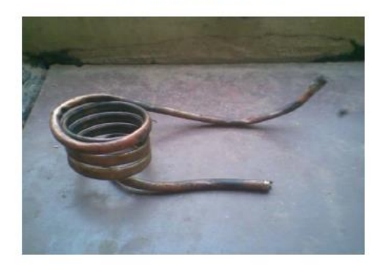
Fig.10 Copper tube after bending