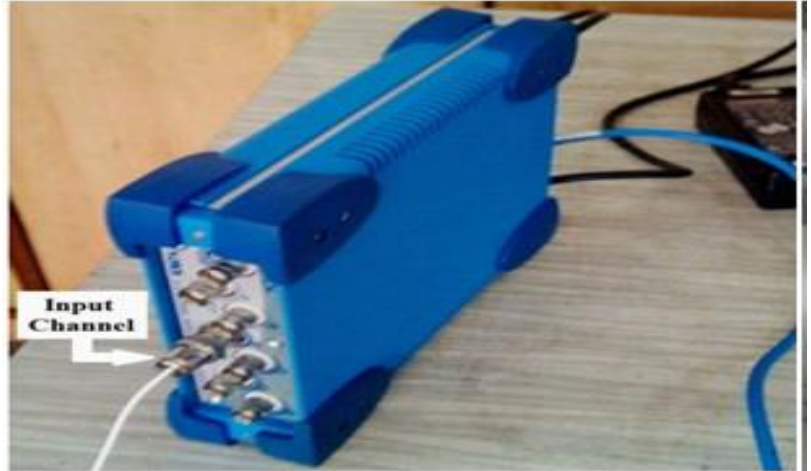
Fig 3.3 FFT Analyser

2. Analyser-The response signal after conditioning is sent to an analyser for signal processing .A commonly used analyser is called a Fast Fourier Transform (FFT) analyser, such as analyser receives analog voltage signals (representing displacement, velocity, acceleration strain or force