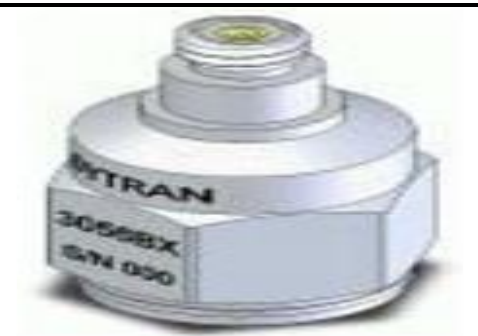
Fig 3.2 Accelerometer

2. Analyser-The response signal after conditioning is sent to an analyser for signal processing .A commonly used analyser is called a Fast Fourier Transform (FFT) analyser, such as analyser receives analog voltage signals (representing displacement, velocity, acceleration strain or force