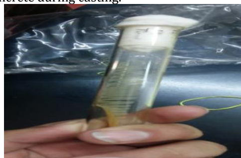
Fig. 1 Pseudomonas Fluorescens

The bacteria are available in solid as well as liquid state too. For making solid bacteria, organic matter should mix with liquid bacteria and make small balls of them and add it in concrete during casting.