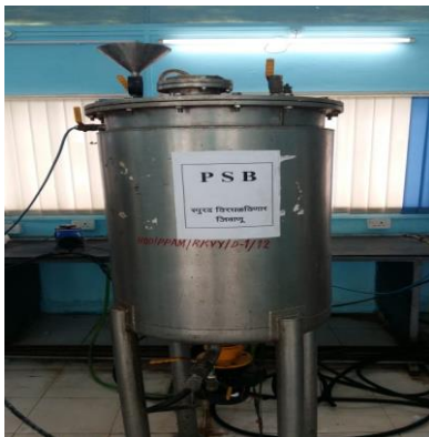
3 Culturing of bacteria