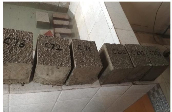
Fig. 4 Curing of Cubes

After 24 hours, the cubes are kept for curing in clean fresh water in curing tank.