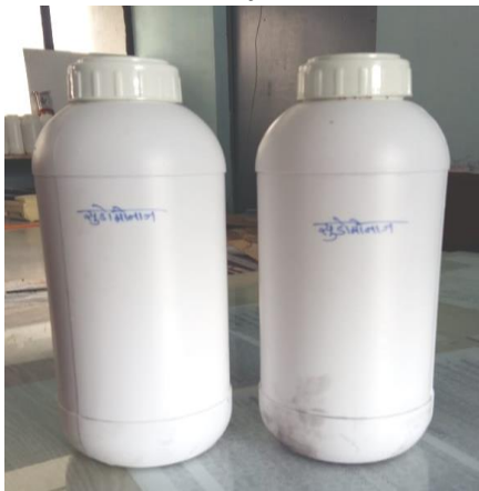
Fig. 2 Storage Bottles

The pure culture is maintained on nutrient agar slant. The strains of bacteria are kept in liquid solution for the growth of bacteria. The bacteria kept for 72 hours in laboratory and then it stored in seal packed bottles. These bottles prevent the bacteria from direct contact with sunlight. The bacteria are kept in 30-37°C temperature to survive easily.