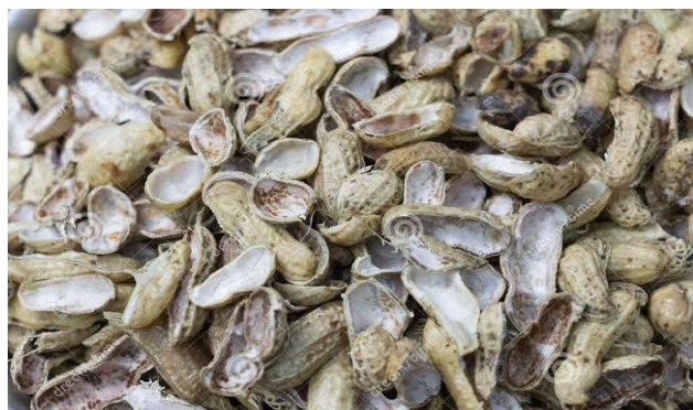
Fig-3 Ground-Nut Shell

Ground-nut shells are very effective media in the filtration of turbid water. The Nano-meter size pores are very efficient in blocking the very small dirty particles present in water and making it turbid.