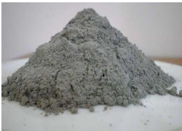
Fig-4 Fly Ash

Fly Ash used as filter media and percolated waste water in fly ash filter media, In this research work provided two different thickness filter media of fly ash in module. Fly ash was collected from cement factory. Fly ash which is available in large scale at the coal fed electric power plants can be efficiently used for the treatment of domestic waste water.