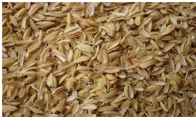
Fig-2 Rice Husk

this, RH is a source of raw material for synthesis and development of new compounds.