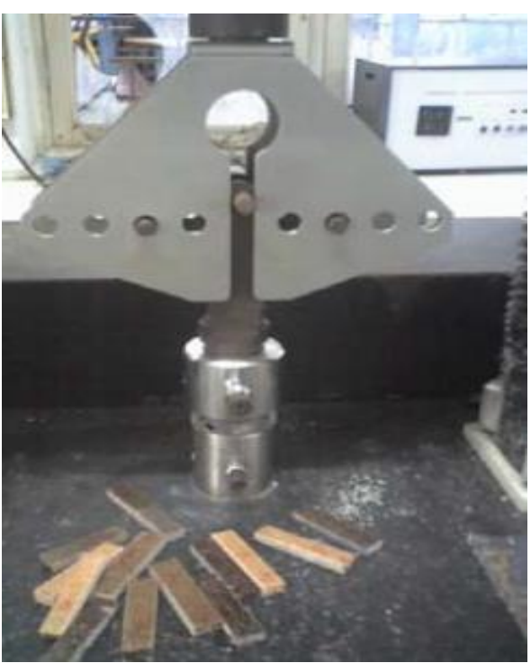
Fig1: Tensile Testing Machine