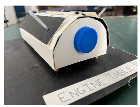
Prototype of engine table is as shown in the image

An estimated upsurge in scrap supply in upcoming decades' demands restructuring of the non-ferrous metal cycle to open up new-fangled recycling paths for alloys and escape a potential scrap surplus.