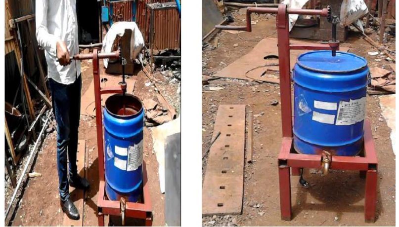
Figure 2. Fabricated Manual Textile chemical mixing and processing machine

As indicated in Figure 2, fabricated manual Textile Chemical processing machine can mix chemical solution by rotating machine handle by hand. The machine can mix the solution uniformly. After chemical solution preparation, the machine mixer can be removed and textile material can be impregnated into the solution for further processing.