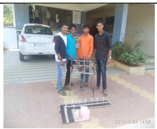
FIG.3 .ACTUAL PROJECT