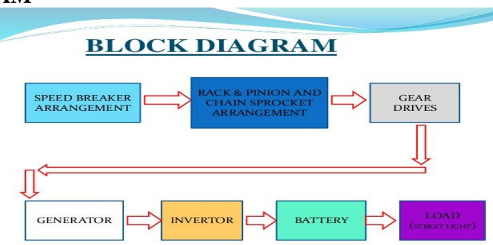
FIG. 1. RACK & PINION MECHANISM