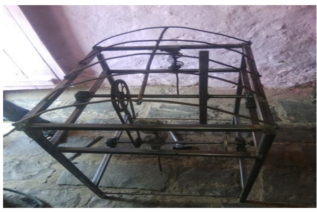
Fig. 2. ASSEMBLY OF PROJECT