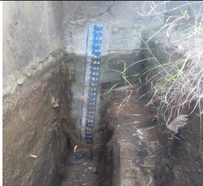
Fig.1 Scale Provided At Standing Wave Flume to Observe Depth of Water