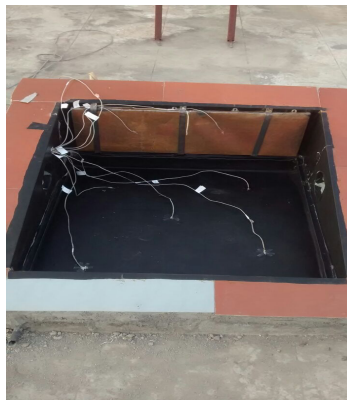
Fig. 2. Actual Set Up of Masonic Solar Still