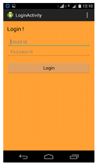
Fig. 4 Login Page

In Association with IET, UK & Sponsored by TEQIP-II 29<sup>th</sup>-30<sup>th</sup>, Jan. 2016